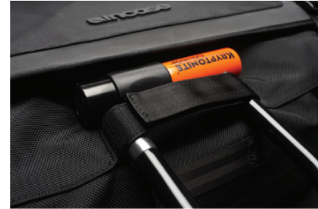
Velcro seatbelt strap for attaching of bicycle lock.

Waterproof zip pocket, reflective zipper tape