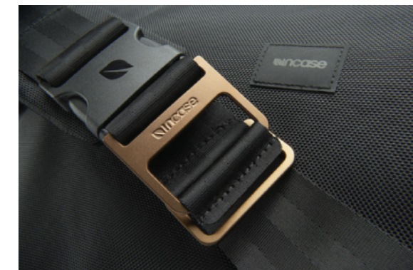
Metal buckel with embossed logo ref. pic for style of buckle